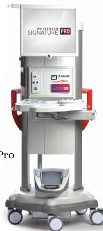
Abbott's Whitestar Signature Pro