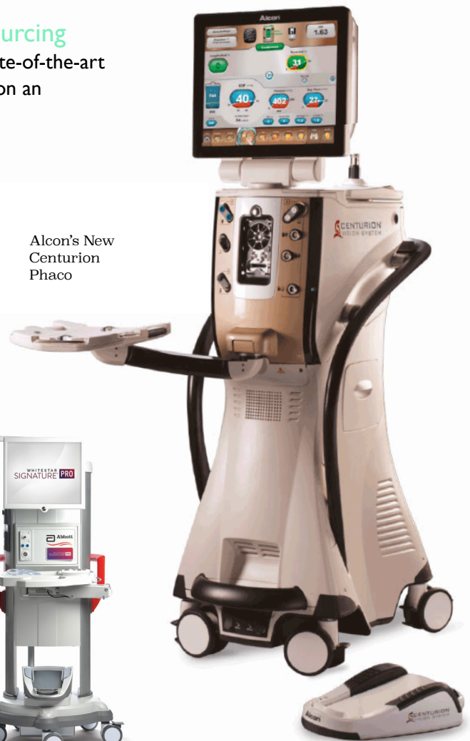
Alcon's New Centurion Phaco

Call (800) 346-0544 for a FREE DEMO DAY!