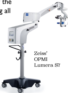
Zeiss OPMI Lumera S7

Based on national average Medicare Reimbursement Guidelines ($1600), the typical fee from Surgical Direct is approximately 40-50% of the total facility fee — including all equipment and supplies.* This helps ensure that your procedures are not only efficient, but profitable on day one!