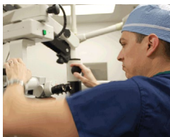
A Reliable Continuity of Trained Ophthalmic Technicians